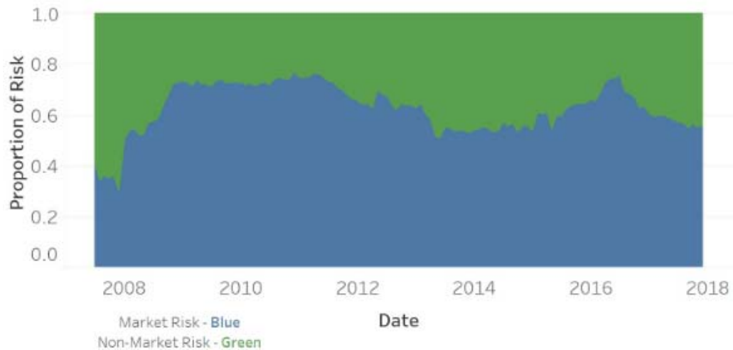
Figure 3: Portfolio risk - Popular Active Australian Small-Cap Equities Fund Rolling 36 months

Note: Benchmark - MSCI Australia.