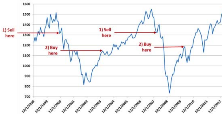
Figure 2: More realistic "irrational" buying and selling S&P 500 January 1998 – March 2013